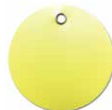
Part #VT2P3RYL Color: Yellow Size: 3" diameter