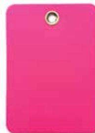
Part #VT2P23FP Color: Fluorescent Pink Size: 2.5" x 3.5"