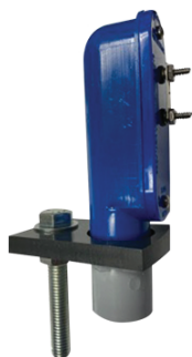
Fire Hydrant Flange Mounting Kit (adapter, bracket, and fasteners)