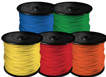
Copper & Copper-Clad Steel Tracer Wire (options available)