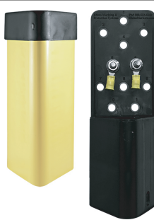
TriView Test Station Retrofit Kit Part# TSRF_____